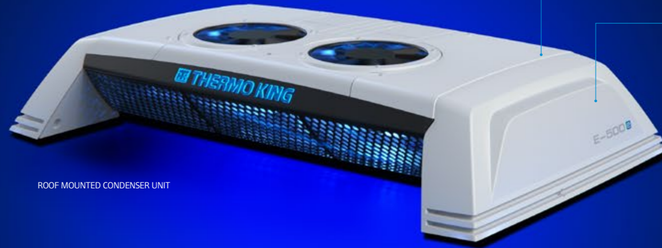
ROOF MOUNTED CONDENSER UNIT

A VERSATILE REFRIGERATION SOLUTION THAT'S THE BEV ANSWER TO INNER-CITY LIMITS.